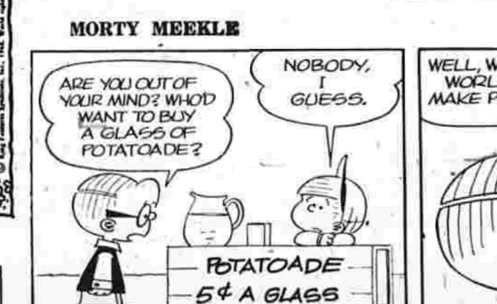
BY DICK CAVALLI