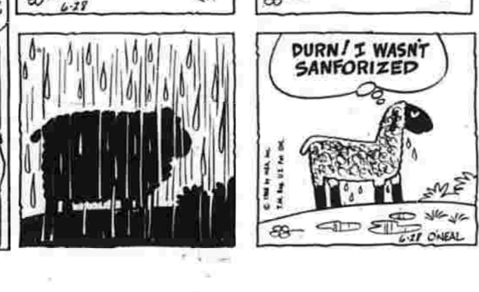
BY FRANK O'NEAL