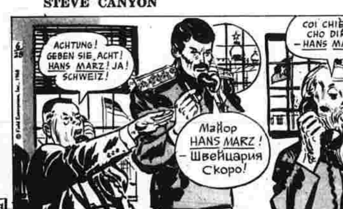
BY MILTON CANIFF