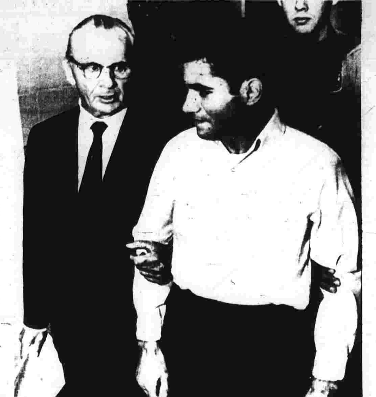
Sirhan Sirhan leaves the jail chapel that served as a courtroom for his scheduled plea in Los Angeles yesterday.

IRENE STEWART Herald Fashion Writer. NEW YORK — It is hardly original to say that this is the season for the individual.